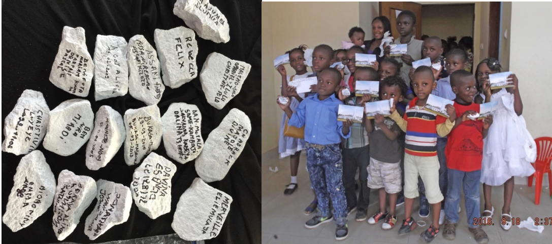
Figure 13a, b. “My name shall be there.” Congolese Primary children were invited to write their name on small stones, hand-cut from the Congo River and painted white, to be embedded within the concrete of the Kinshasa Temple. The children shown at right belong to the Buima Branch in Bas Congo

Even though the word “Lord” is a limiting description in its own way, I began to feel that I could not think of a better word to characterize my relationship to Him as I consecrate myself anew each time I go to the temple. He is my Lord because I belong to Him; because I am bound to Him in a covenant relationship; and because for the blessings of life and salvation I am “indebted unto him, ... and will be, forever and ever.” 77 According to Moses 5:4, and consistent with some strands of rabbinic tradition, 78 this was the name Adam and Eve used as they “called upon the name of the Lord” in the fallen world.