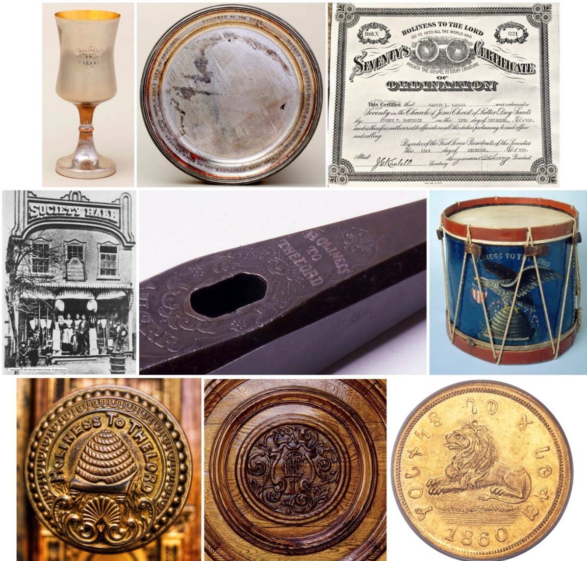
Figure 5: (top): sacrament goblet,18 sacrament plate,19 Seventy's certificate of ordination;20 (middle): Salt Lake City Fifteenth Ward Relief Society Hall with window banner,21 hammer head,22 drum;23 (bottom): door knob on the Salt Lake Temple24; escutcheon with monogram (HTTL) on an outer door of the Salt Lake Temple25; 1860 Mormon five-dollar gold piece with "Holiness to the Lord" written in the Deseret Alphabet26

The pioneer Saints ... affixed ... "Holiness to the Lord," on seemingly common or mundane things as well as those more directly associated with religious practice. It was inscribed on sacrament cups and plates and printed on certificates of ordination of Seventies and on a Relief Society banner. "Holiness to the Lord" also appeared over the display windows of Zion's Cooperative Mercantile Institution, the ZCMI department store. It was found on the head of a hammer and on a drum. "Holiness to the Lord" was cast on the metal doorknobs of President Brigham Young's home.