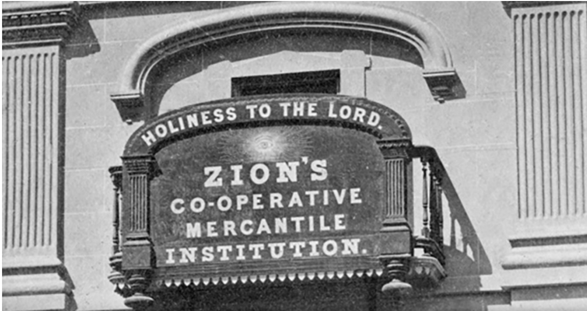
Figure 14. ZCMI Co-op Store displaying a “Holiness to the Lord” motto 80