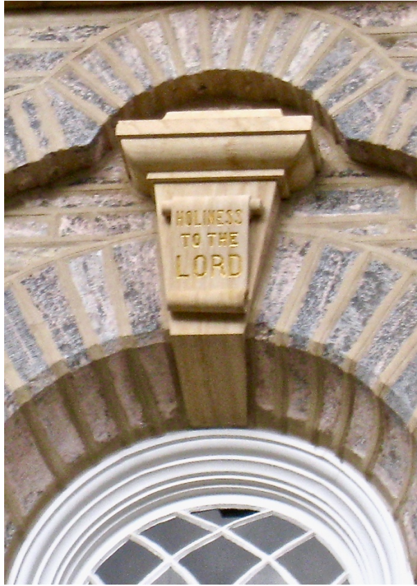
Figure 7. “Holiness to the Lord” appears on this window keystone of the Logan Utah Temple 37