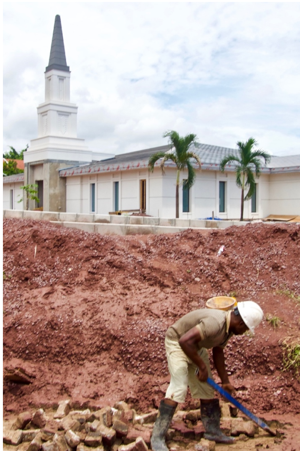
Figure 11. The Democratic Republic of the Congo Kinshasa Temple

in renewing our baptismal covenants by partaking of the emblems of the sacrament, “we do not witness that we take upon us the name of Jesus Christ. [Rather], we witness that we are willing to do so. 66 The fact that we only witness to our willingness suggests that something else must happen before we actually take that sacred name upon us in the [ultimate and] most important sense.” 67 The baptismal covenant clearly contemplates a future event or events and looks forward to the temple.