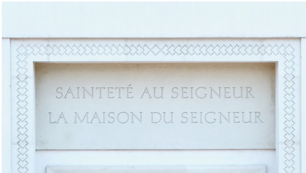
Figure 12. Kinshasa Temple inscription: “Holiness to the Lord – The House of the Lord,” consistent with the English King James Translation

However, when the long-awaited inscription finally appeared, it was not what I had expected. Instead of reading “Sainteté à l’Éternel” (= “Holiness to the Eternal One”), it followed a literal translation of the English King James Version, namely “Sainteté au Seigneur” (= “Holiness to the Lord”). 71