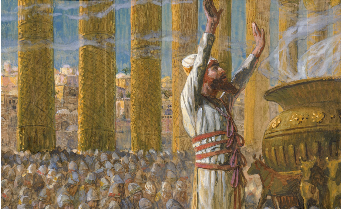
Figure 10. James Tissot: Dedication of the temple of Solomon

As temples are prepared for our members, our members need to prepare for the temple.