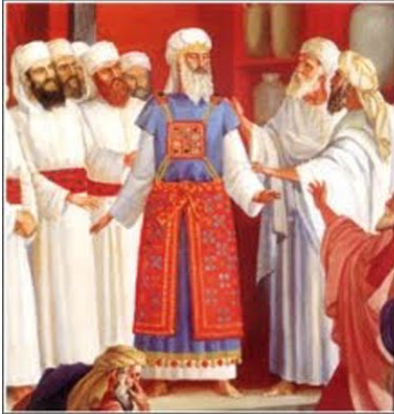
Figure 9. Worshiping the high priest.