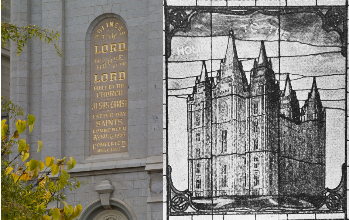
Figure 4a, b. a. Dedicatory inscription for the Salt Lake Temple. 13 b. Detail from the memorial window adjoining the Council Room of the First Presidency and the Twelve, with the inscription “Holiness to the Lord” appearing as in the clouds above the building. 14 The inscription, “set beneath the cloud-stones, symbolizes the reality of the establishment of [God’s] kingdom on earth with the Temple as His personal sanctuary where heaven and earth are joined in a perfect order. It is also the place (as are any of the temples) where the inhabitants of Zion or those pure in heart can gather and be taught of light and truth. ... A house ... to which He may come or send His messengers, to confer priesthood and keys and to give revelation to His people.” 15

Salt Lake City. The administration of Brigham Young encouraged a flowering of the use of “Holiness to the Lord.” The words appeared not only in plans for the dedicatory inscription of the Salt Lake Temple, 16 but throughout the entire territory of Deseret. As Elder D. Todd Christofferson described it: 17