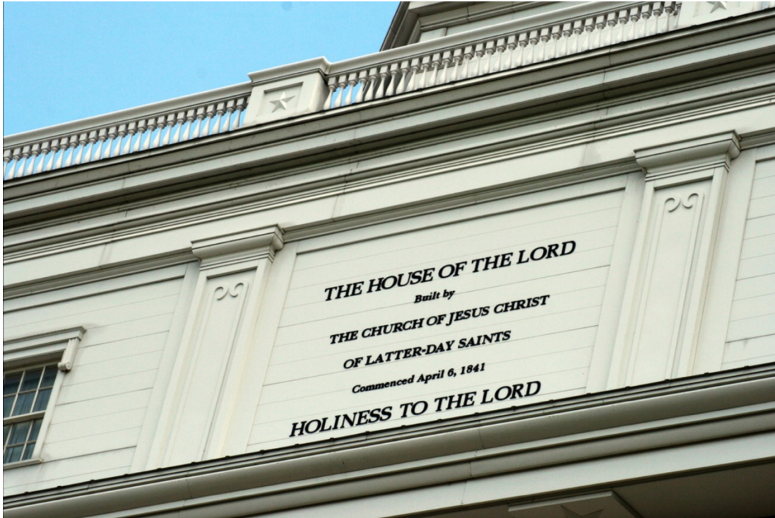
Figure 4. Inscription on the reconstructed Nauvoo Temple 11

Details of the inscription as it appears on the reconstructed Nauvoo Temple are shown here. The date of “April 6, 1841” that had been selected for the groundbreaking recalled the anniversary of the organization of the Church in 1830. Unlike the inscription above, the words on the original temple were gilded brightly. 12