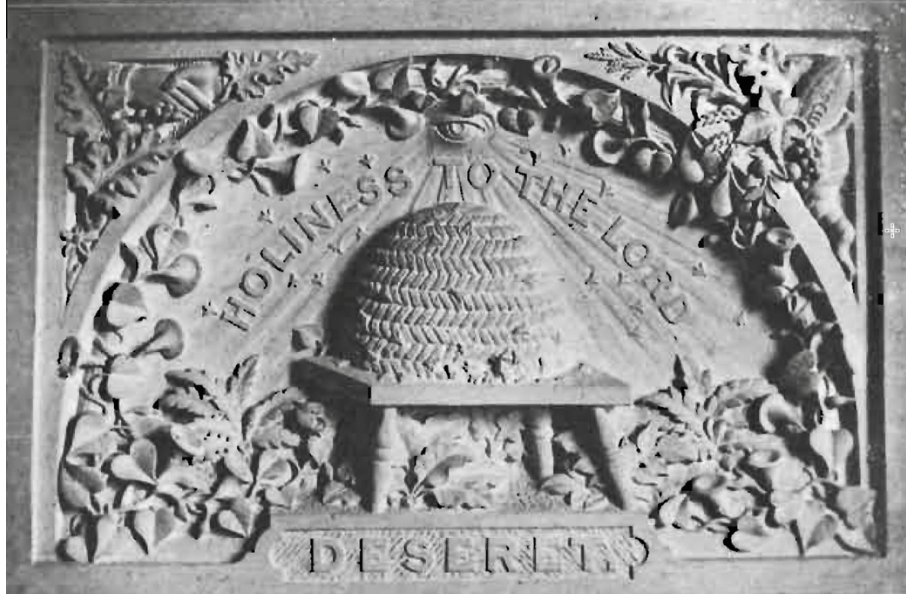
Figure 6. The "Deseret Stone," placed in the George Washington National Monument in Washington, D.C., photographed by Marsena Cannon, 19 March 1853 27

Washington Monument. In response to an invitation to each state and territory of the United States, “the General Assembly of the provisional State of Deseret passed a resolution on 10 February 1851, approved by Utah Territorial Governor Brigham Young a few days later, to provide a block of marble to the Washington Monument.” 28 The principal illustrations on the stone were described by the First Presidency of the Church as “a Bee-hive, in full operation, in the centre, encircled by the convolvulus [i.e., the “twining plant with trumpet-shaped flowers” 29 ], &c, with the inscription, ‘Holiness to the Lord. Deseret.’” 30