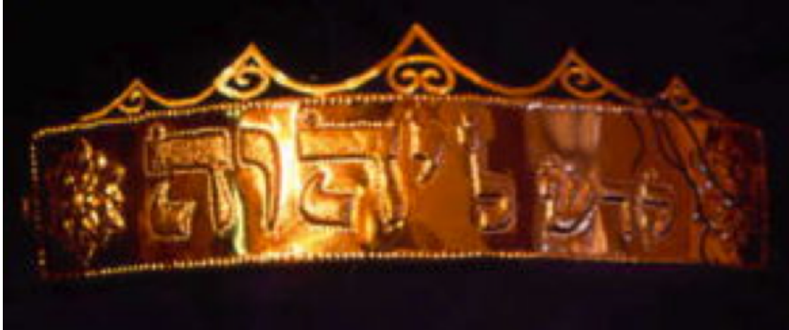
Figure 8. Artist's conception of the plate of pure gold that was to be worn on the forehead of the high priest, as described in Exodus 28:36-38; 39:30

How was the phrase used in the Old Testament? Briefly, it was applied to people, not to buildings. As mentioned above, the phrase “Holiness to the Lord” is never used in the Bible in connection with the temple itself. Instead, the Israelites were instructed to engrave these words on a “plate of pure gold” that was to be worn upon the forehead of high priests who had been consecrated to the Lord’s service through sacred ordinances. 39