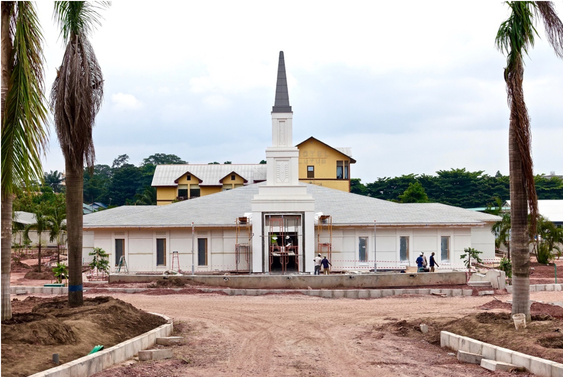
Figure 11. Culminating work begins around the Kinshasa Temple doorway

Like some other reflections I have had about the temple over the years, this one came as I thought specifically about the difference between English and French versions of temple-related phrases. Through these experiences I have come to agree with the observation of an eminent scholar of translation, Walter Benjamin, that a good “translation transplants the original into a more definitive linguistic realm.” 68 In other words, sometimes, ironically, a translation may promote a better understanding of the original, in effect allowing “the pure language [that is beyond any particular language], as though reinforced by its own medium, to shine upon the original all the more fully.” 69